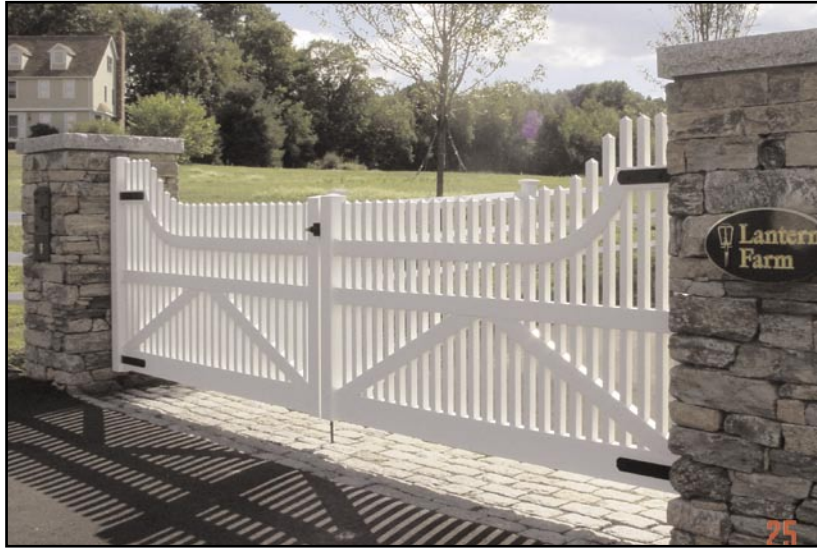
This magnificent, stately 16' double drive PVC gate was just completed by Colonial Fence in Massachusetts with the help of their Fence Masters Z7 CNC router. And at the bottom left is another of their high-end, custom-made creations; a PVC arbor serving as the entrance to a stone walkway.

Their latest project is a custom 16' step curved double drive PVC gate for a driveway entrance. "It is going to be a pointed 1.5" spindle gate with each 8' side having a 12" step curve drop rail. The bracing for this gate is going to be inside the rails, and it too is going to be another custom straight down drop rail because the pickets are going through the bracing for a smooth clean look.